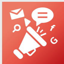
Marketing – Eloqua