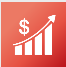
Sales and Service